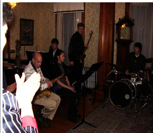
The Winchendon School Jazz Band Performs