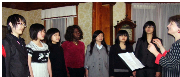
The Winchendon School Chorus performs at the "Night of Music" at the Murdock Whitney House.

Be sure to check out the SALE on items in the Museum Store!!